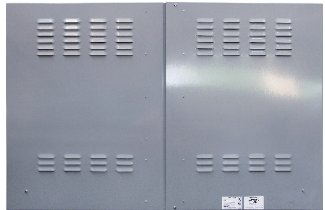
LED Driver Power Panel Exterior