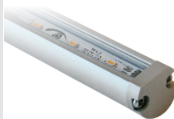
(Beam Angle based on 2RL fixture with Clear Acrylic lens)